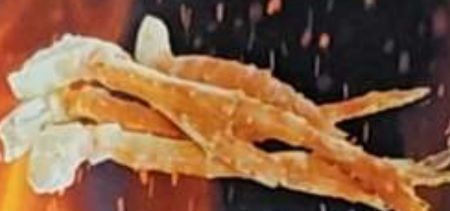
King Crab MARKET PRICE