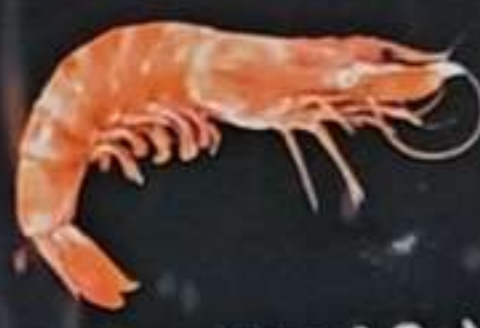
Shrimp (Head On) MARKET PRICE