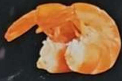
Shrimp (No Head) MARKET PRICE