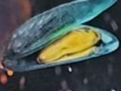
Green Mussel MARKET PRICE