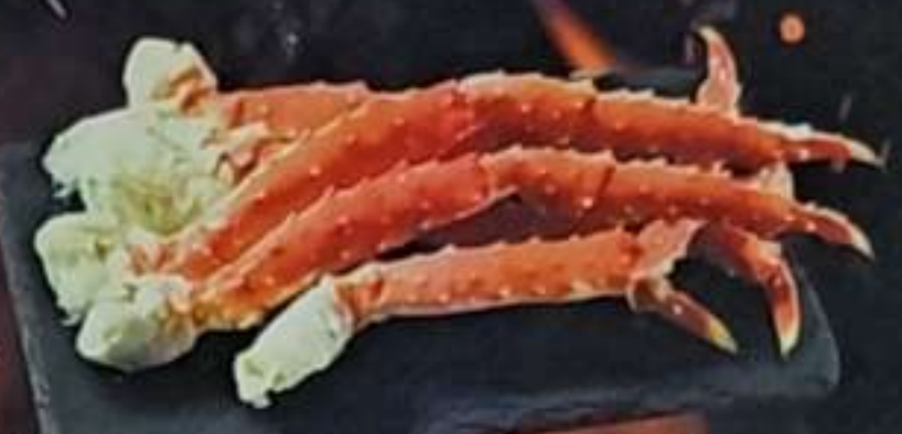
Colossal King Crab MARKET PRICE