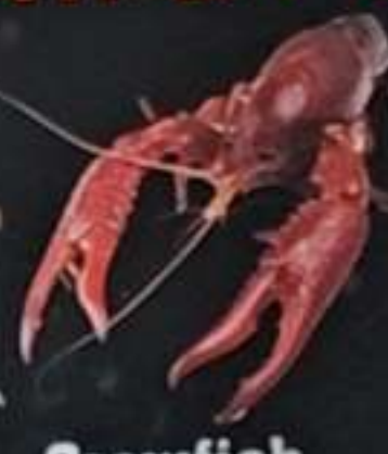
Crawfish MARKET PRICE