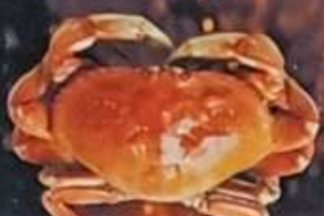
Dungeness MARKET PRICE