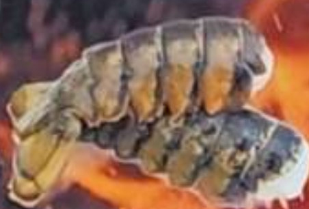
Lobster Tail MARKET PRICE