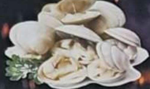
Clams MARKET PRICE