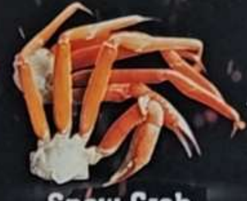
Snow Crab MARKET PRICE