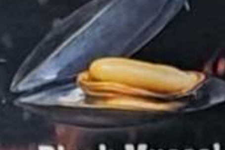
Black Mussel MARKET PRICE