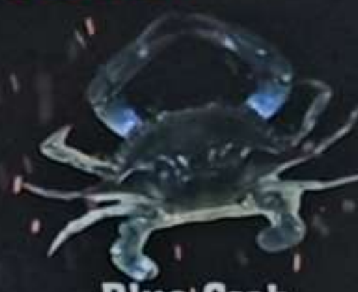
Blue Crab MARKET PRICE