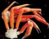
Snow Crab $34.99