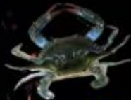
Blue Crab MP