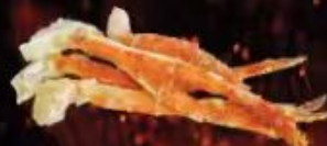
King Crab Legs MP