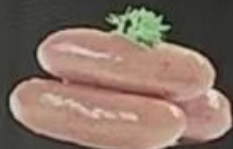
M13. Sausage $6.99 ½ lb $12.99 1 lb