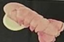
M10. Lobster Tail $41.99 LB(M/P)