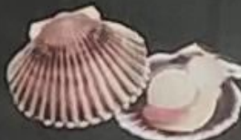
M12. Scallops $15.99 ½ lb $29.99 1 lb