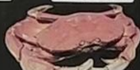
M11. Dungeness $35.99 LB(M/P)