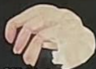
M2. Shrimp (No Head) $11.99 ½ lb $21.99 1 lb