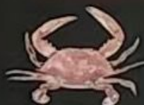
M1. Blue Crab (Seasonal) MP LB(M/P)