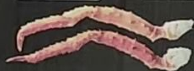
M9. King Crab Legs MP LB(M/P)