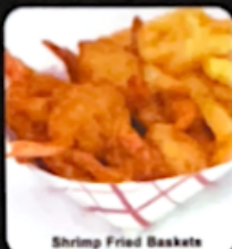
Shrimp Fried Baskets