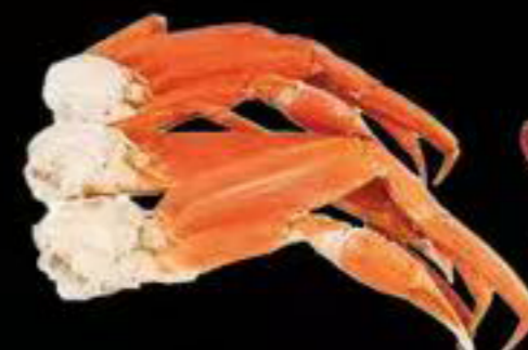
Snow Crab Legs M/P LB(M/P)