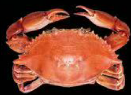
Blue Crab (Seasonal) M/P LB(M/P)