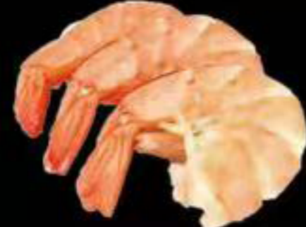
Shrimp (No Head) $24 LB(M/P)