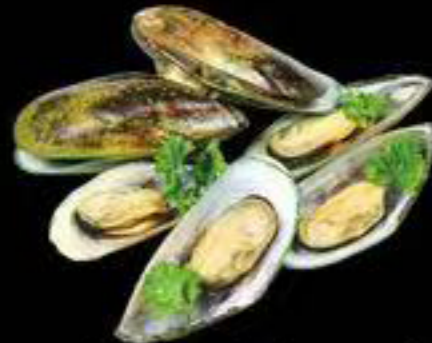
Green Mussels $17 LB(M/P)