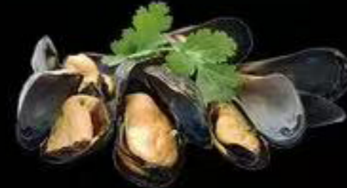
Black Mussels $16 LB(M/P)