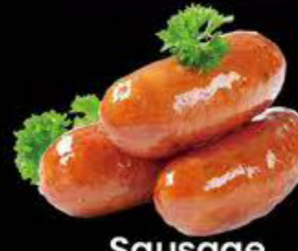
Sausage $12 LB(M/P)