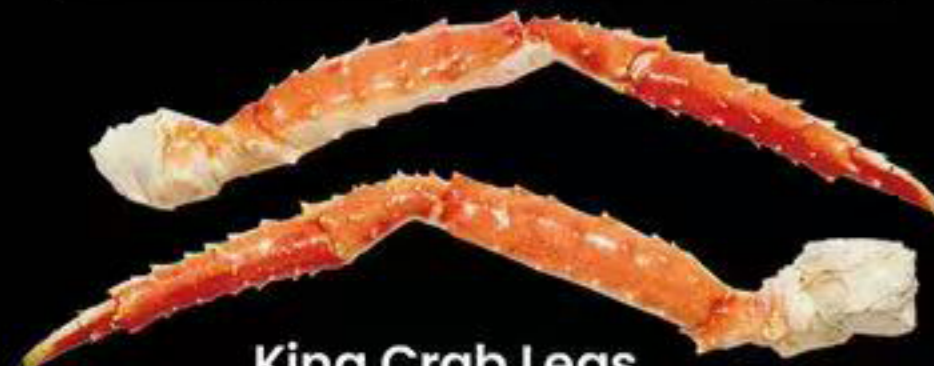
King Crab Legs M/P LB(M/P)