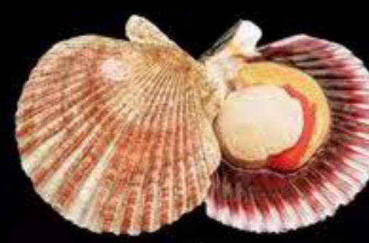
Scallops $36 LB(M/P)