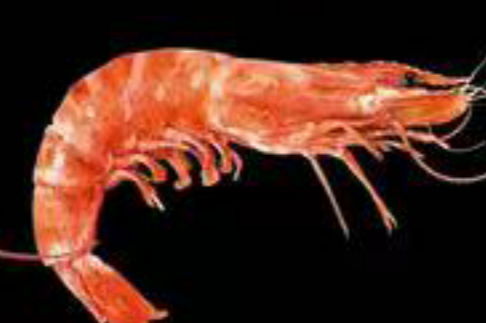
Shrimp (Head on) $22 LB(M/P)