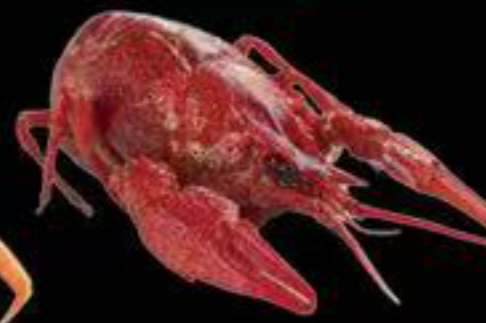
Crawfish $17 LB(M/P)