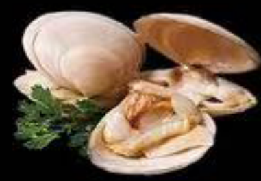
Clams $16 LB(M/P)