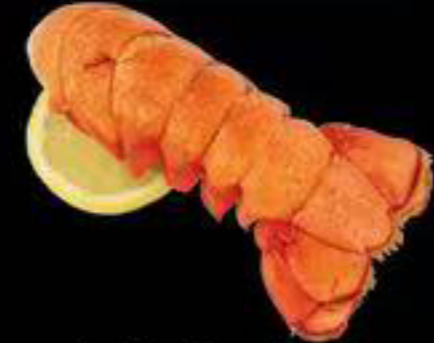
Lobster Tail M/P 3PCS