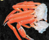
M3. Snow Crab Legs