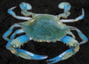
M1. Blue Crab (Seasonal)

Every Pound of Seafood Come with 1 Corn & 1 Potato